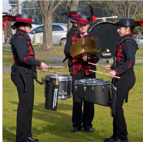
Moama Anglican Grammar Drumline