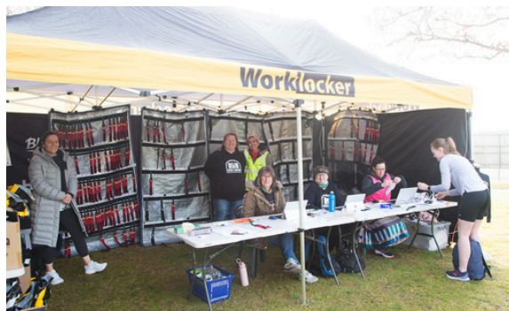
Run Echuca Moama 2024 Registration Tent