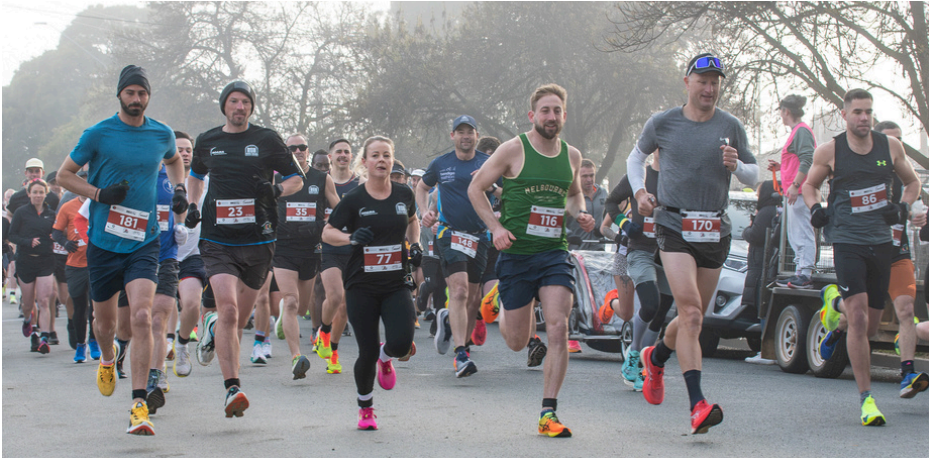
21.1km event start line at Run Echuca Moama 2024